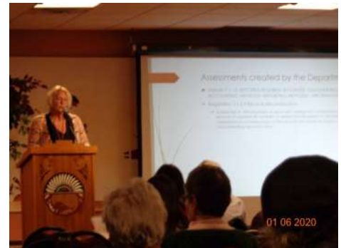
New Mexico Update Presenter: NMTRD Representative