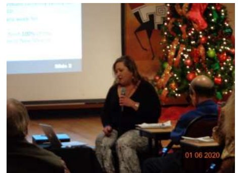
New Mexico Update Presenter: NMTRD Representative