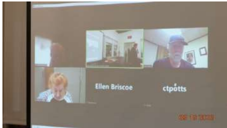
5 Virtual Attendees