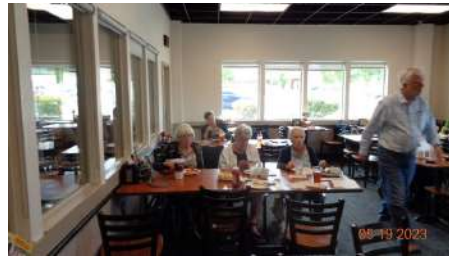
20 In-Person Attendees