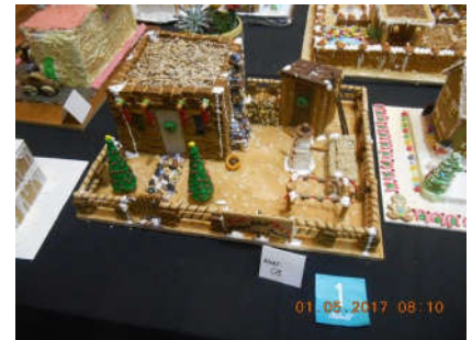
Indian Pueblo Cultural Center Ginger Bread House Contest Winner (Adult Division)