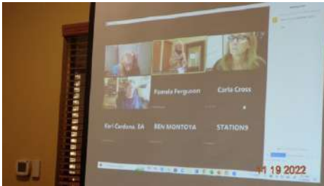
Virtual Attendees (10)