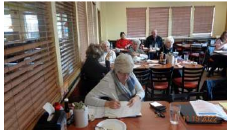
In-Person Attendees (14)